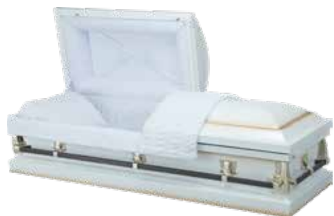
American-Style Caskets* American-style Caskets are available in wood or metal in a wide selection of designs From £1,470